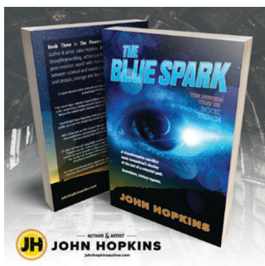
Square Banner 1 1080x1080