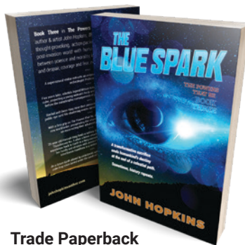
Trade Paperback 1600x1600