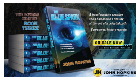
Landscape Banner 3 1600x900