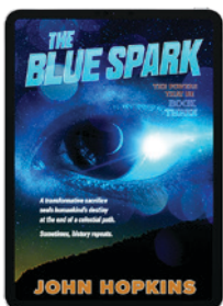
Apple Books 540x750

Downloadable links for book reviews, blog posts, and social media.