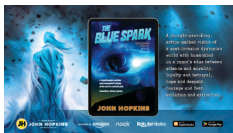
Landscape Banner 2 1600x900