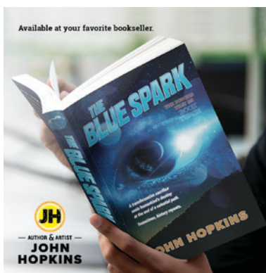
Square Banner 2 1080x1080