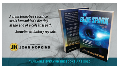
Landscape Banner 1 1600x900