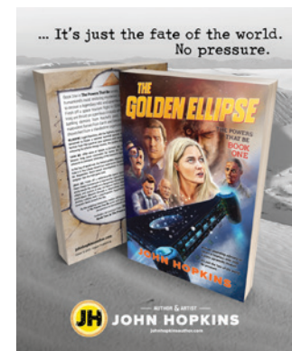
Portrait Banner 1080x1350