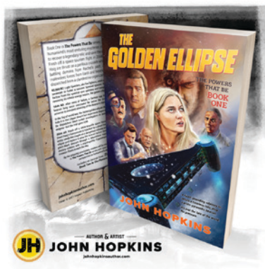
Square Banner 1 1080x1080