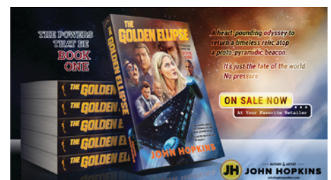
Landscape Banner 3 1600x900