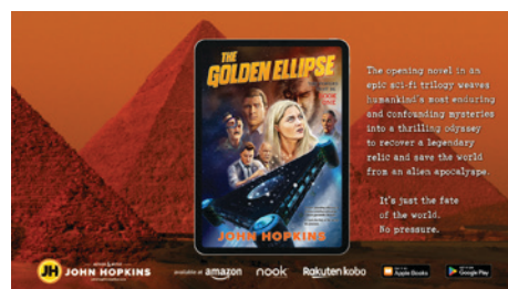
Landscape Banner 2 1600x900