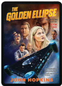
Apple Books 540x750

Downloadable links for book reviews, blog posts, and social media.