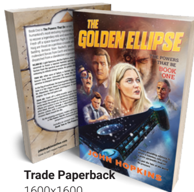
Trade Paperback 1600x1600