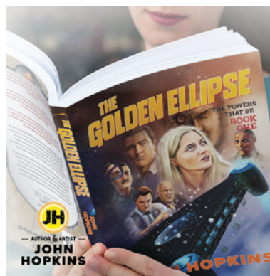
Square Banner 2 1080x1080